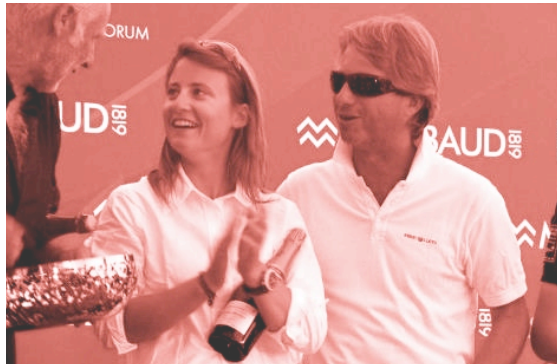
Complementary skills & winning success factors for this new Olympic Class